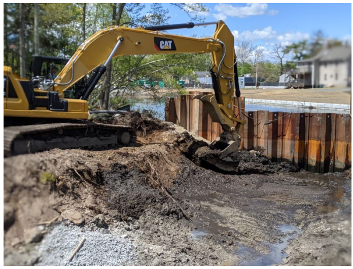
Wetland Planting (top) and Excavation at Area 8 (bottom)